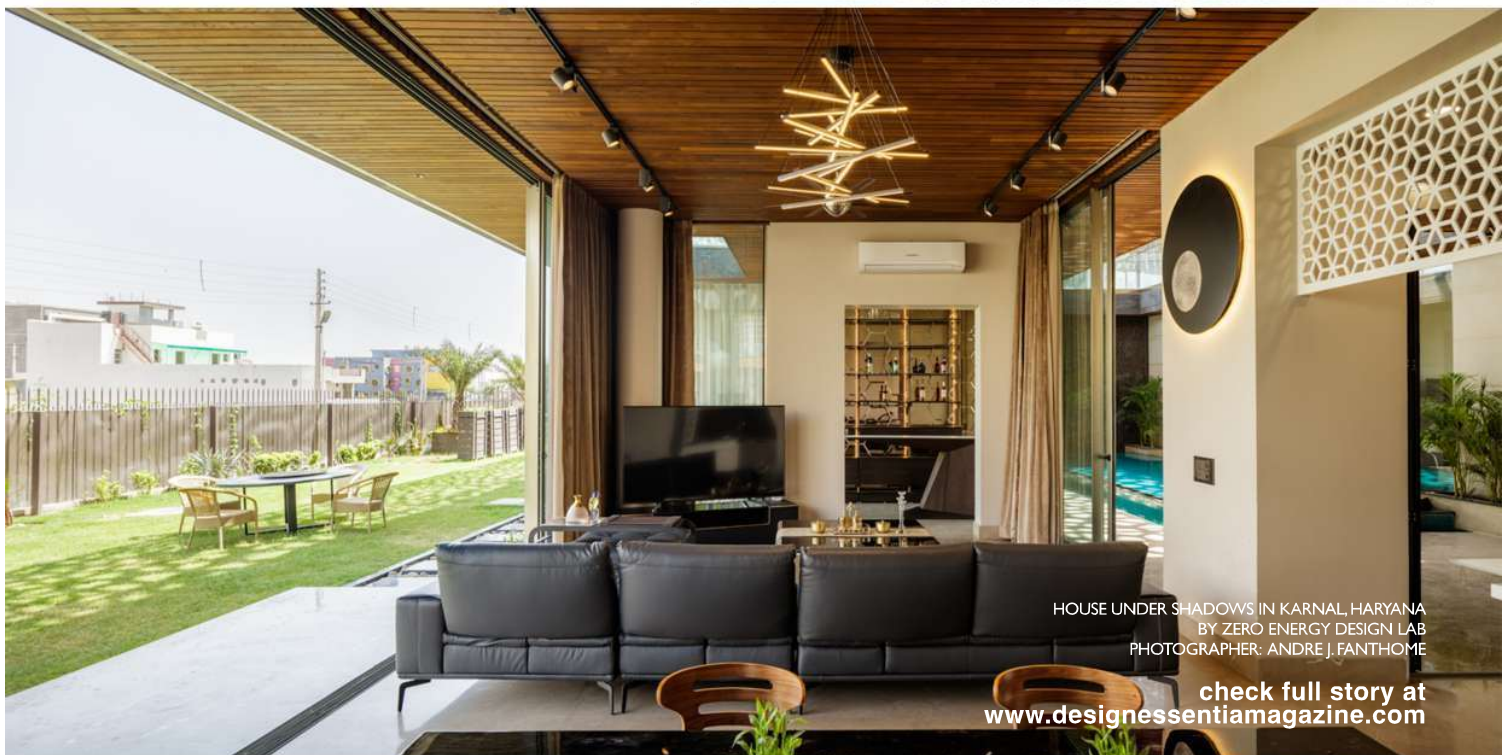
HOUSE UNDER SHADOWS IN KARNAL, HARYANA BY ZERO ENERGY DESIGN LAB

check full story at www.designessentiamagazine.com